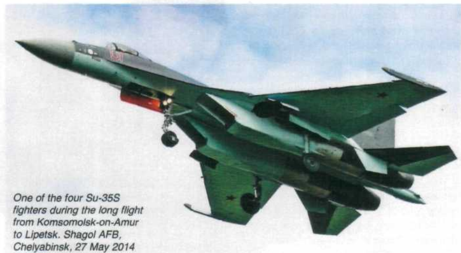
One of the four Su-35S fighters during the long flight from Komsomolsk-on-Amur to Lipetsk. Shagol AFB, Chelyabinsk, 27 May 2014

The squadron launched regular operation of its advanced Su-35S fighters on 24 March 2014. Prior to that, its air and ground crews had undergone a programme of conversion to the type at a Sukhoi facility, and the regiment had adapted its material and technical resources for the operation of the advanced type. According to the Sukhoi's Su-35 programme director, chief designer Igor Dyomin, the preparations had begun as far back as 18 months before the delivery of the first fighters to the unit. Special ground test equipment had been ordered and tested in Akhtubinsk. Electronic tablets with the operation support software are ready for the introduction into aircraft maintenance