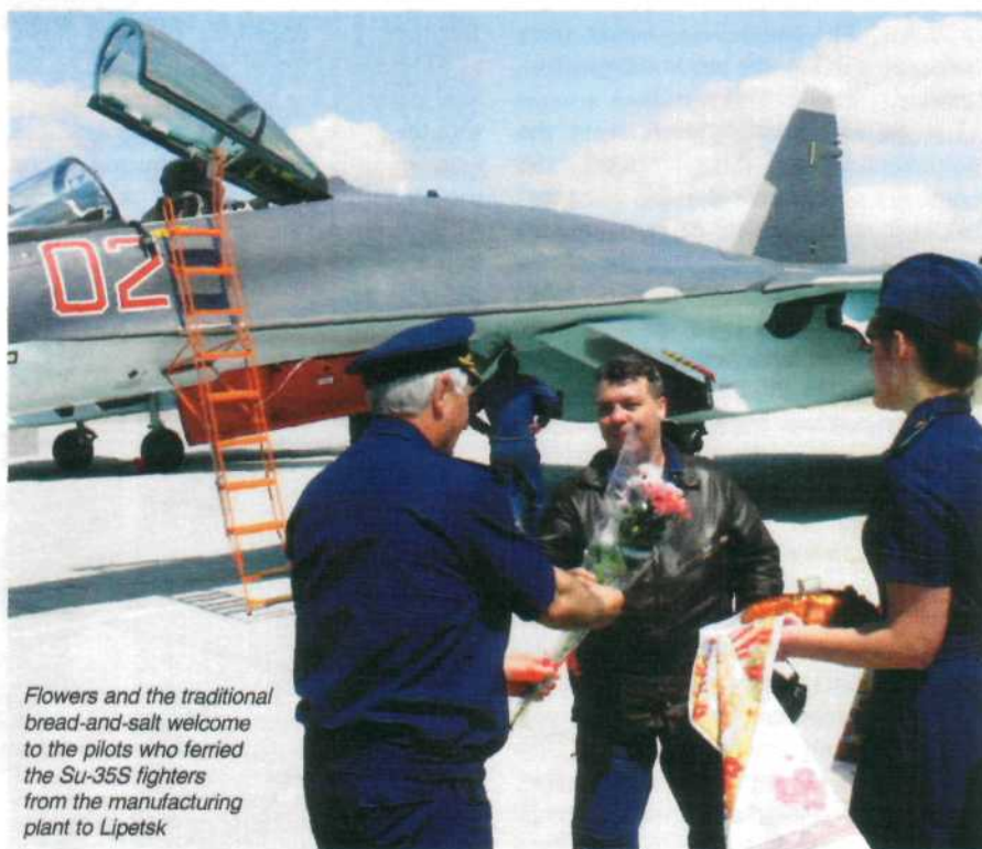
Flowers and the traditional bread-and-salt welcome to the pilots who ferried the Su-35S fighters from the manufacturing plant to Lipetsk