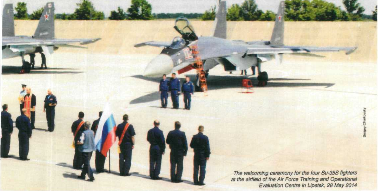
The welcoming ceremony for the four Su-35S fighters at the airfield of the Air Force Training and Operational Evaluation Centre in Lipetsk, 28 May 2014