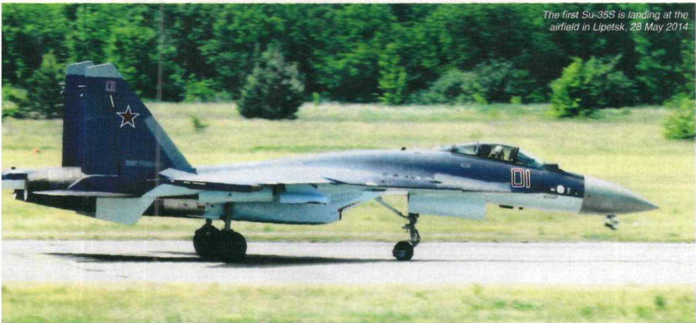
The first Su-35S is landing at the airfield in Lipetsk, 28 May 2014