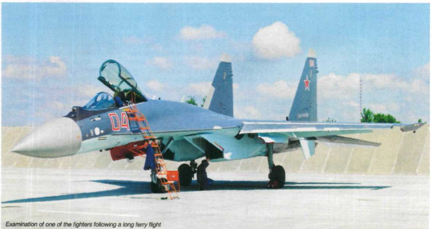
Examination of one of the fighters following a long ferry flight