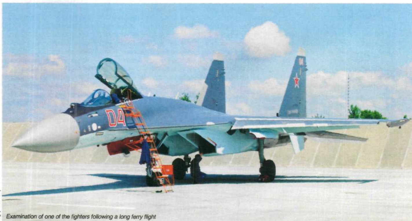
Examination of one of the fighters following a long ferry flight